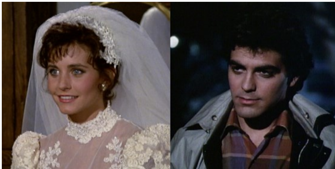
Courteney Cox and George Clooney: So very young!

COZI TV understands this mentality perfectly, and this Thanksgiving is giving us a few dozen reasons to be thankful — with a four-day back-to-back marathon of classic TV episodes showing some of our favorite actors in their earliest roles.