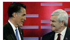
Romney continues feud with Gingrich